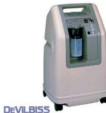
Fig. 4: Oxygen concentrator