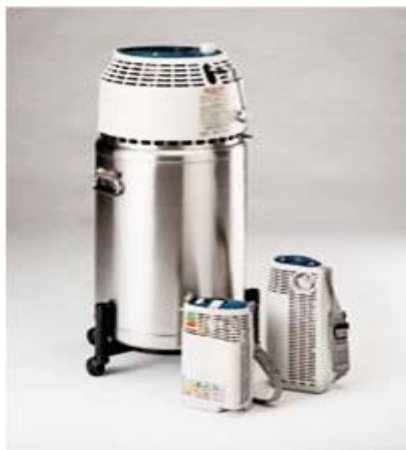
Fig. 3: Liquid oxygen container

These are electrically driven machines which take in normal air and concentrate oxygen to the required level up to 5ltr/min. these provide a long term solution to the patients who require prolonged oxygen therapy. They are relatively expensive, one time investment, portable and easily available. Their drawbacks are that they need continuous power supply, produce noise and vibration, machine failure, and give only up to 40% FiO 2 .